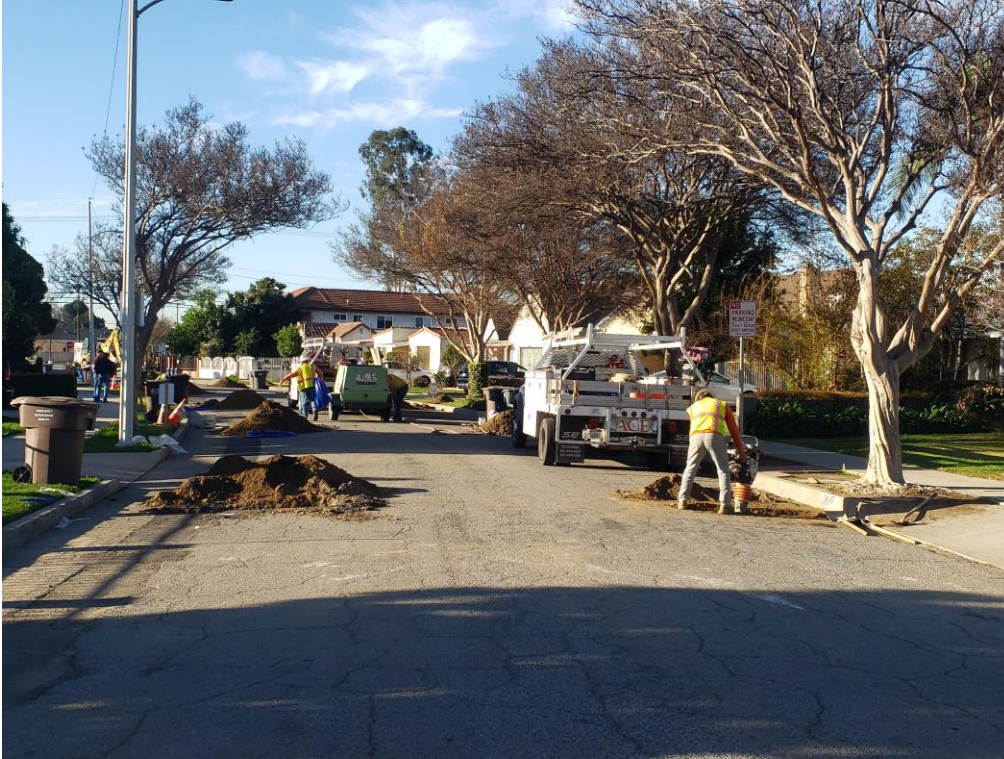
Placing new curb & gutter on Granada looking south to Ramona (Area 3)